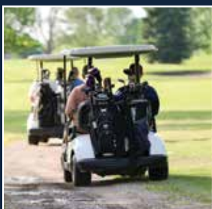
Golf Cart Accidents